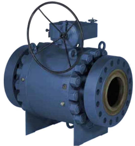
TRUNNION MOUNTED BALL VALVE