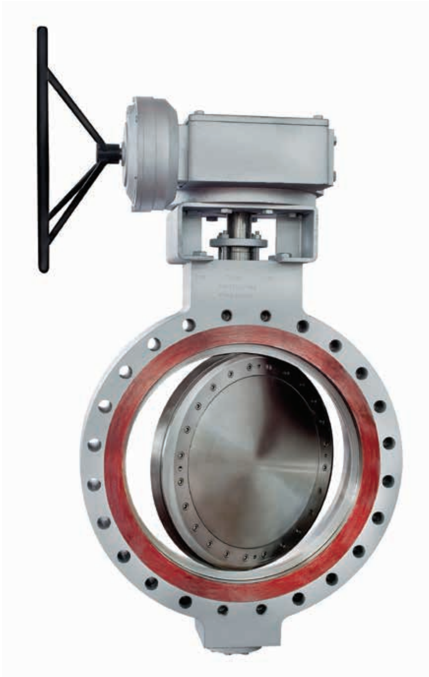
TRIPLE OFFSET VALVE