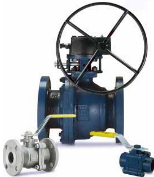
FLOATING DESIGN BALL VALVE